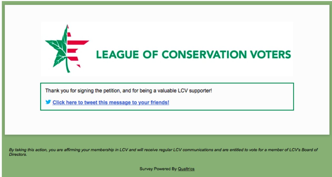
Figure A1: A screenshot of the tweet encouragement randomly shown to respondents in either of the DM conditions who completed the online petition.