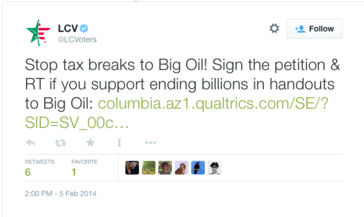
Figure A5: The public tweet from Study 1.