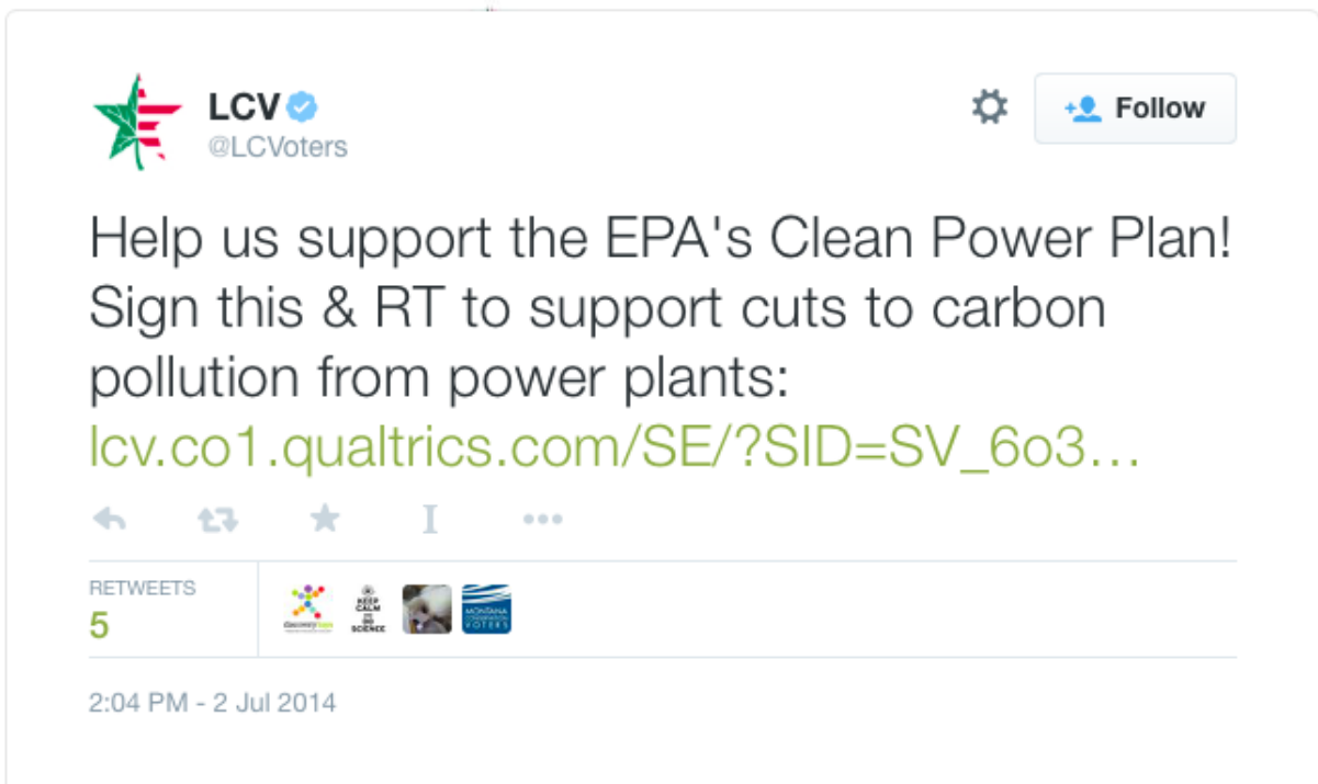
Figure A6: The public tweet from Study 2.