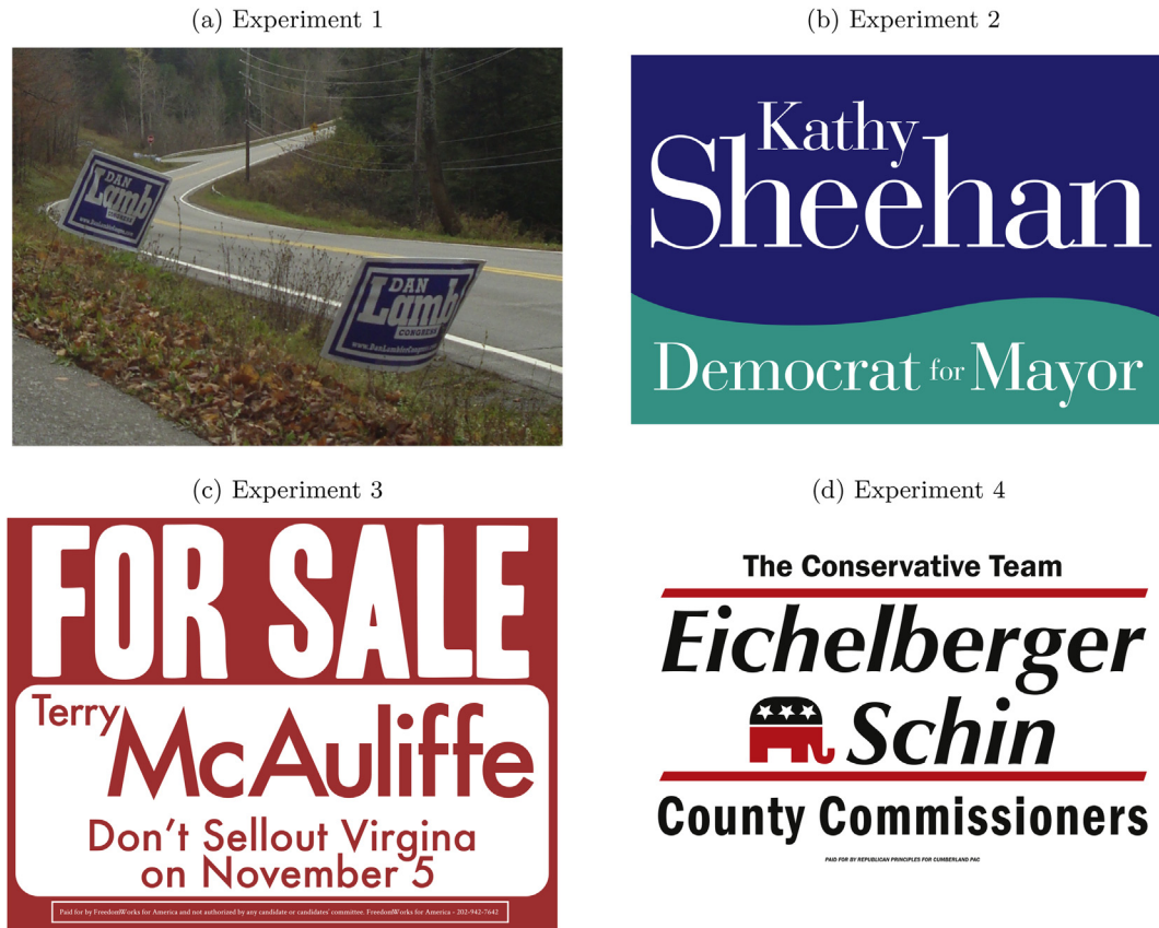
Fig. 1. Signs.

1986), which implies that subjects are affected solely by the treatment to which they are assigned; treatments assigned or administered to others are assumed to be inconsequential. This assumption is jeopardized when treatments spillover as the result of communication or contagion. Because lawn signs can be seen by anyone who passes by, untreated precincts may be affected by the treatments that neighboring precincts receive. In effect, there may be potential outcomes other than “treated” and “untreated”; some precincts may be partially treated. To reestablish “stable” potential outcomes, we must develop a model of potential outcomes that includes this intermediate case.